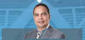
DEPUTY FINANCE MINISTER YB DATO' WIRA HAJI AMIRUDDIN HAJI HAMZAH