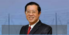
FINANCE MINISTER YB TUAN LIM GUAN ENG